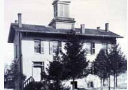
Old Mechanics Academy, where Mercy Hospital first opened in 1873